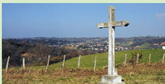
The wayside cross at point no. 3

An interesting route taking in the Urguri district with its striking Labourdin houses. Ridges at the panoramic viewpoints overlooking the valleys of Saint-Pée-sur-Nivelle and Sare, the presence of the Nivelle, and rural moorland add to the charm of this route.