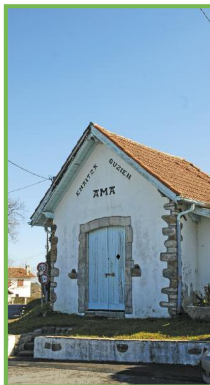
The little chapel

1h00 When you reach the little chapel, turn right, and carefully make your way back to the village.