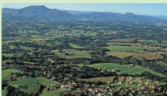
Aerial view of Arbonne

This pleasant route alternates between meadows and woods. The nature of the vegetation implies that water is ever-present in the soil.