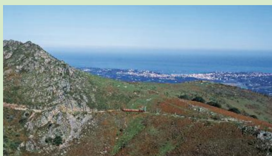
Ocean view from the Rhune

A hike which will take you to the summit of the Rhune, where you can get your breath back before tackling the descent. This route boasts exceptional views.