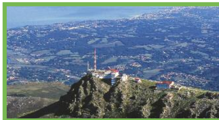
Summit of the Rhune

Much of the Rhune is used as rangeland, as shown by the countless flagstone roof "cayolars" (sheepfolds) and flocks of sheep and pottoks. The summit can also be accessed via a small cog railway train, which departs from the mountain pass of Saint-Ignace.