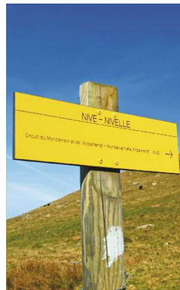
A local photo of footpath signposting

Walk times: The time taken to complete each route is given as a guide only, taking account of the length of the route, the change in altitude and any difficult aspects.