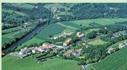
Aerial view of Biriadou

F rom the village of Biriadou, which is worth a visit in itself, this route sets out to tackle the Basque hills. In addition to the magnificent coastal views, you should come across pot-toks, sheep and griffon vultures.